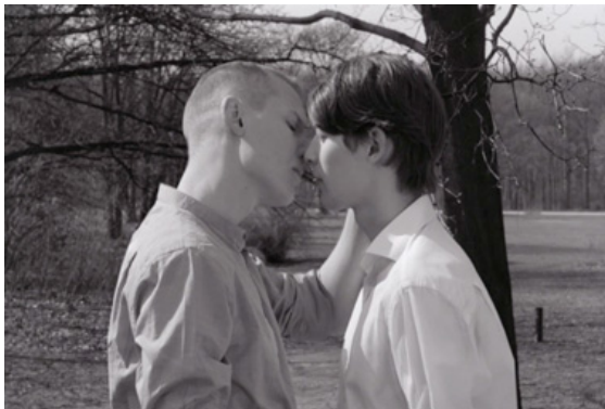
'The Kiss' is part of a homosexual holocaust memorial in Berlin

It wasn't until 2002 that the German government apologised or payed reparations for the treatment of homosexuals during the holocaust.