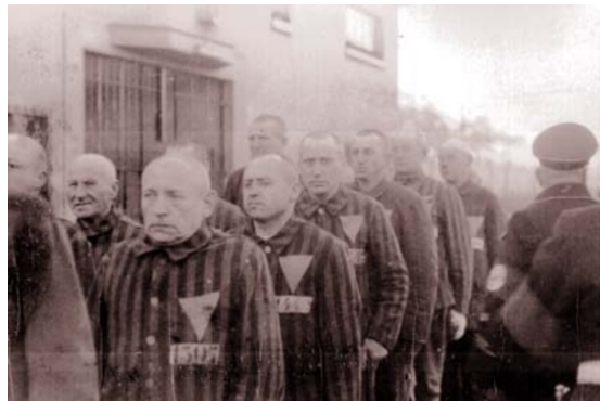
Men wearing the Pink Triangle

Sex between men was illegal in Germany under paragraph 175, and as the Nazis occupied more territory they spread the law to countries like France where homosexuality was legal, if not still taboo.